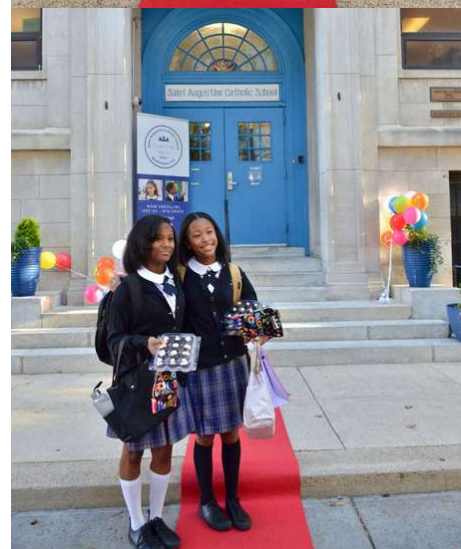
We rolled out the red carpet for our students and parents on the first day of school, Sept. 3!